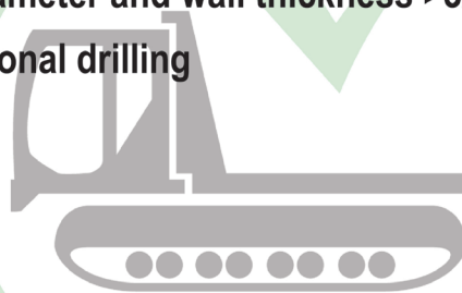
RUBBER TRACKED VEHICLE