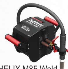
HELIX M85 Weld Head shown with: K52106-15 Torch