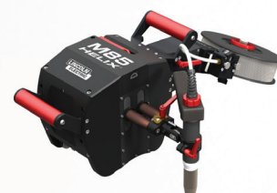
HELIX M85 Weld Head shown with: K52230-1 Wire Feeder and K52223-25 Torch